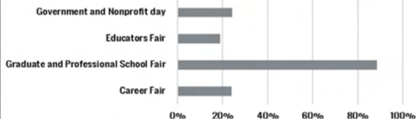
Percentage of New Employer / Representative Attendees