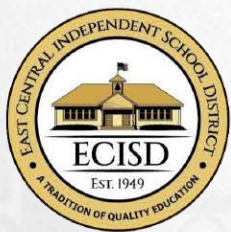
East Central ISD

A dynamic network of ISDs and a public university partnering to build a brighter future for South Bexar County, enhancing the school-to-college pipeline and providing accessible programs and services for teachers, students and families.