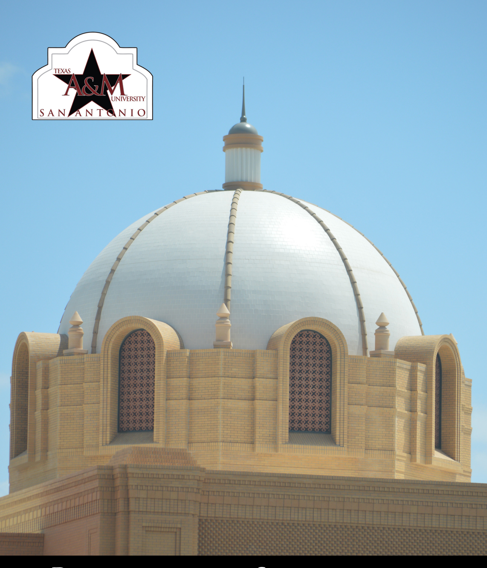
RESEARCH AND SCHOLARSHIP 2010 – 2014